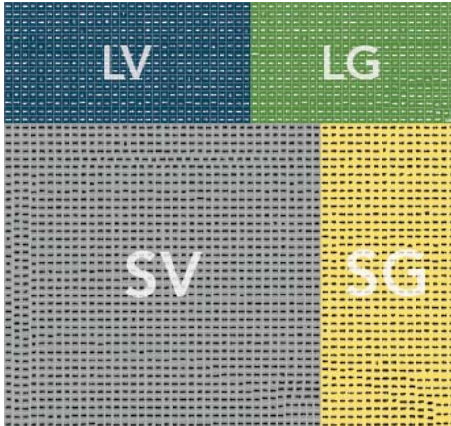
Exhibit 2. US Stocks Sized Equally

For illustrative purposes only. Illustration includes the constituents of the Russell 3000 Index as of December 31, 2016 on an equal-weighted basis segmented into Large Value, Large Growth, Small Value, and Small Growth. Source: Frank Russell Company is the source and owner of the trademarks, service marks, and copyrights related to the Russell Indexes. Please see Appendix for additional information.